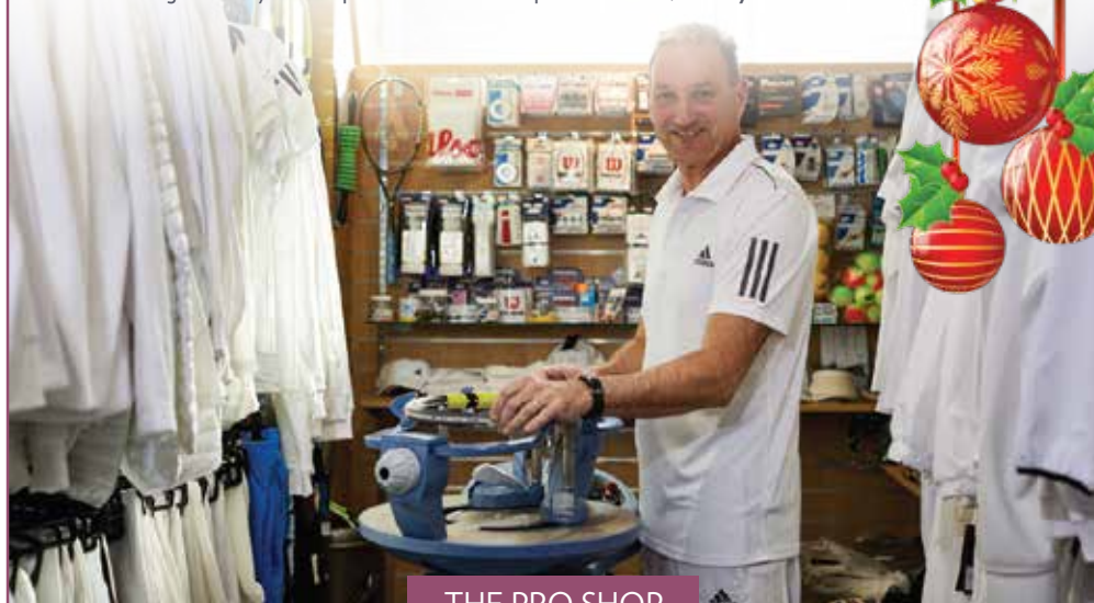
THE PRO SHOP